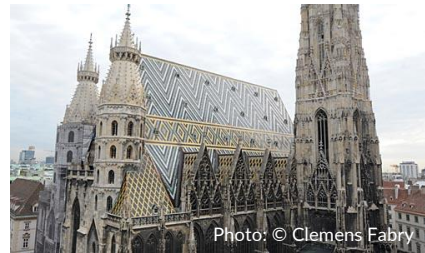
St. Stephen's Cathedral

St. Stephen's Cathedral has 23 bells in total. The largest bell is officially named after St. Mary, but usually called "Pummerin" (Boomer) and hangs in the north tower – it weighs 20,130 kilograms (44,380 pounds) and is the second largest swinging bell in Europe after the one in the Cologne Cathedral.